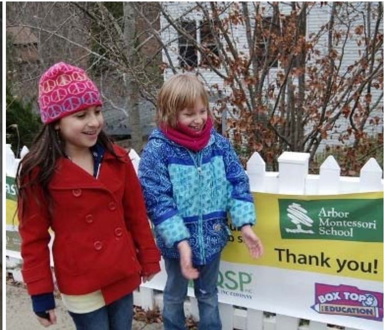
Scenes from our recent "weather event!"