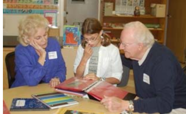
Images of Grandparents Day, November 24, 2009